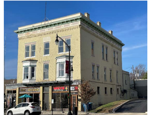
415 W. Main Street was built in 1908.

In 2023, the Art Center of the Bluegrass will restore and renovate the 12,600 square foot, structurally sound, historic property adjacent to our current location at 401 W. Main Street. As the Art Center approaches its 20 th anniversary, the restoration and renovation of this second building – 415 W. Main Street – will generate new cultural opportunities for community members and visitors alike, while dramatically transforming the region’s creative arts ecosystem. Our vision for 415 W. Main is to expand the Art Center’s dynamic and inclusive arts community while preserving the legacy of Danville’s internationally famous glassmaker Stephen Rolfe Powell.